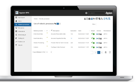
Orchestrate bots from a web-based control center.