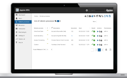
Orchestrate bots from a web-based control center.