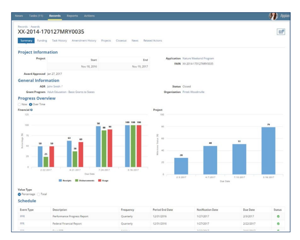
Designed to integrate with existing federal systems like SAM, FMS, and Grants.gov, so that processes and data are handled more efficiently and with less risk of human error.

End-to-end grant management functionality from award to close-out. Including comprehensive monitoring tools to ensure a standardized approach that is compliant with federal regulations.