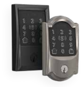
BE499 Shown with Century trim in Matte Black and Camelot trim in Satin Nickel