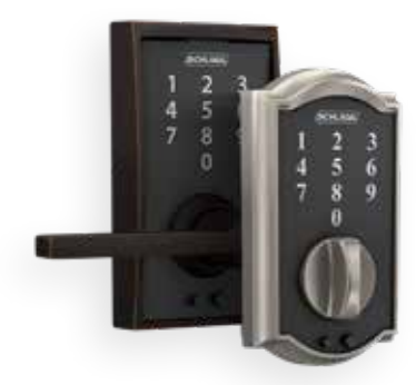
FE695 & BE375 Shown with Century trim in Aged Bronze with Latitude lever and Camelot trim in Satin Nickel