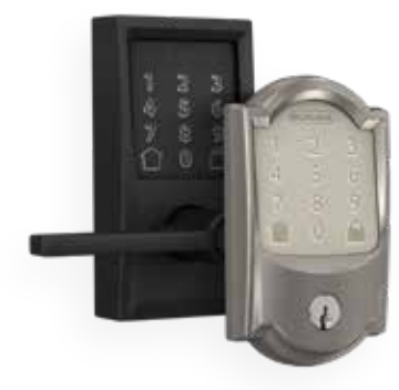
FE789 & BE489 Shown with Century trim in Matte Black with Latitude lever and Camelot trim in Satin Nickel